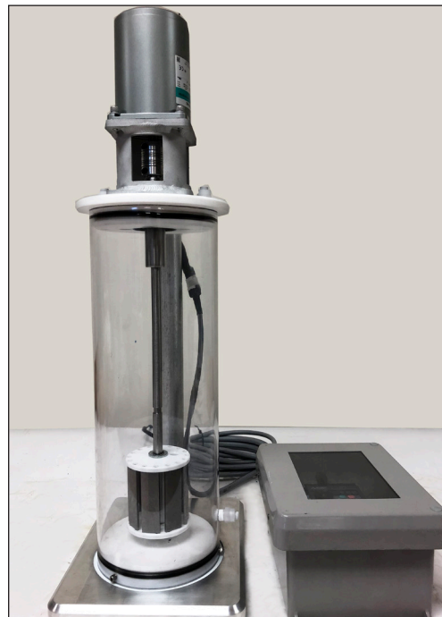
Atmospheric Pressure Rotating Cage to Evaluate Corrosion Inhibitors in the Oil and Gas Industry

Note: Please refer to Coupon Chart and Alloy table to order suitable coupons for testing.